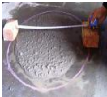
Fig. 1 Slump Flow Test

The lab test is done with each batch of the mix. On lifting the slump cone, filled with concrete, the concrete flows and the diameter of the spread mix is measured in two opposite directions. A stop clock is started and the time taken is noted simultaneously. The mean diameter of the concrete mix shows the capability to flow freely in the moulds. The time taken is a secondary indication of flow. The time taken in seconds is noted upto the mix reaches the first concentric circle which is 500mm in the steel plate. (figure 1).