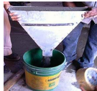
Fig. 2 V- Funnel Test